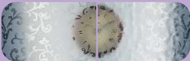
Pilkington Oriel Brocade ™

With a superb range of designs, together with diffused glass options for each design, this premium range of etched glass adds a touch of style and elegance to your home.