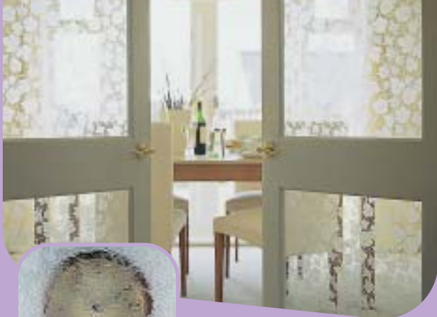
Pilkington Oriel Coppice ™