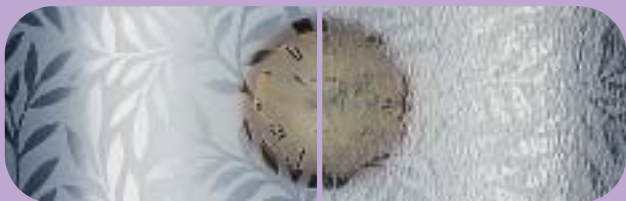
Pilkington Oriel Laurel ™